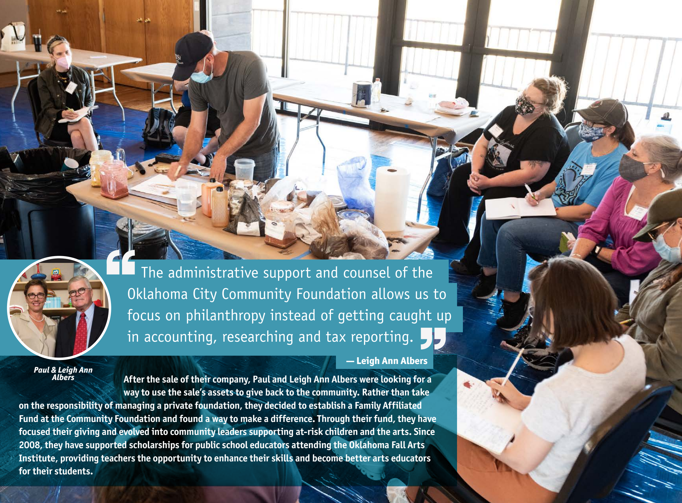
Photo: Teachers were able to explore their passion for the arts with the help of scholarships from the Albers Family Affiliated Fund.

“ The administrative support and counsel of the Oklahoma City Community Foundation allows us to focus on philanthropy instead of getting caught up in accounting, researching and tax reporting. ”