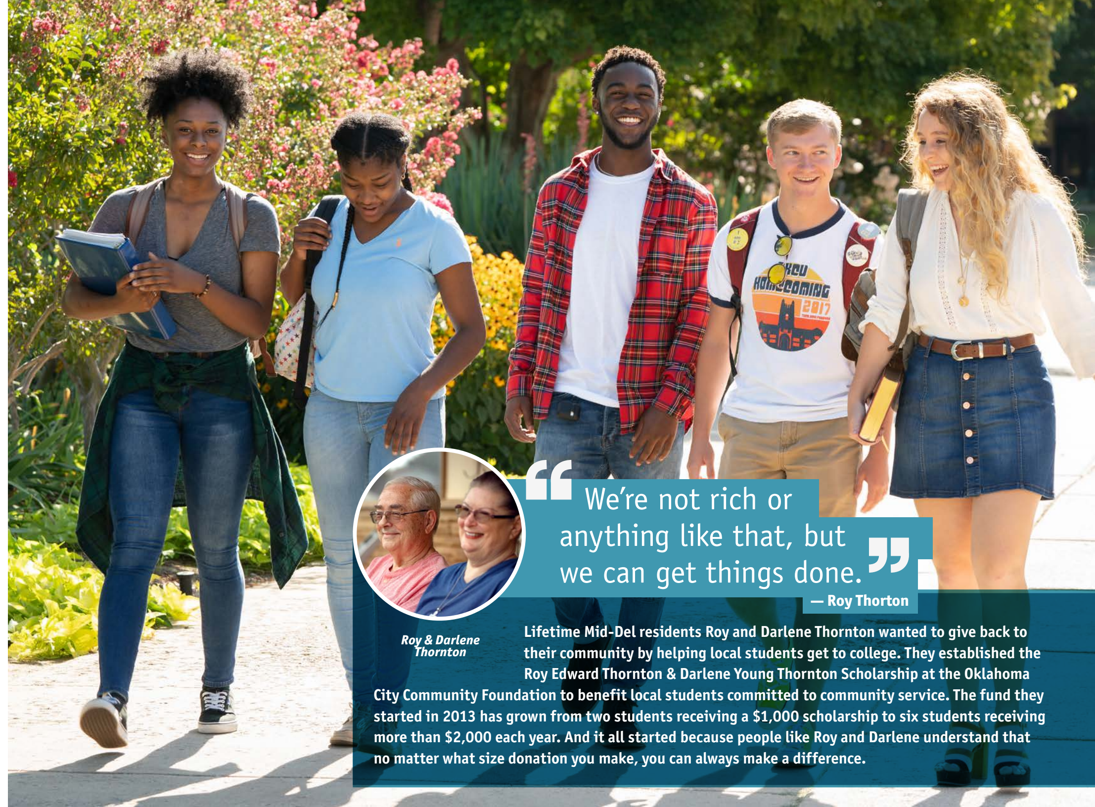
Photo: OCCF Scholarship recipients

“ We’re not rich or anything like that, but we can get things done. ”